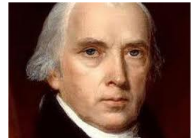
James Madison works with Baptists to write the Bill of Rights, including the guarantee of Religious Liberty for every US citizen.